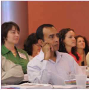
2010 Practicum Participants

Applications are now being accepted through April 2 to attend the 6th Annual Mary Frances Picciano Dietary Supplement Research Practicum on the NIH campus from June 4–7. The practicum provides a comprehensive grounding in issues, concepts, and controversies about supplements and ingredients in these products. It also details the importance of scientific investigations to evaluate the efficacy, safety, and value of dietary supplements for health promotion and disease prevention, as well as how to carry out this type of research.